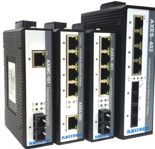
AXES Unmanaged 10/100M Ethernet Switch

9-56VDC Dual Power input, Operating temp: -40°C to +85°C